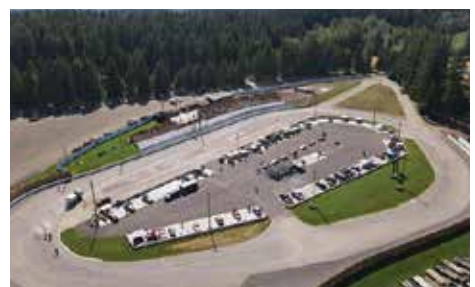
The 2026 Northwest Super Late Model Series visits Canada for the first time in July at Saratoga Speedway on Vancouver Island.

Spokane, WA – The Northwest Super Late Model Series is excited to announce our tentative schedule for the 2026 season. The series will return for four traditional events, while adding one new venue, as well as returning to a marquee event that has been absent from the schedule for several years. All told, the series will sport a more condensed six-race schedule, concentrating on marquee events across the Pacific Northwest.